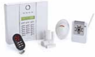
PowerMaxExpress QuickFit Kit