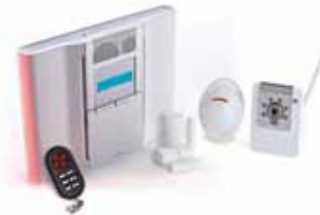
PowerMaxComplete QuickFit Kit